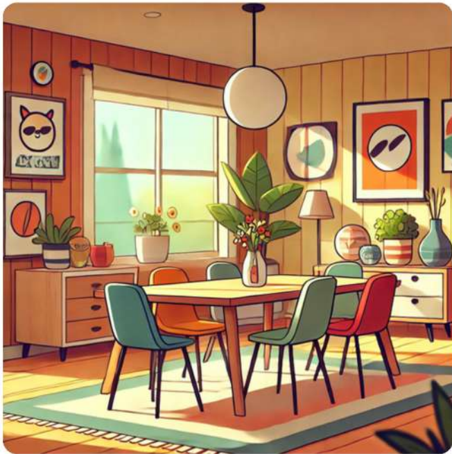
a dining room